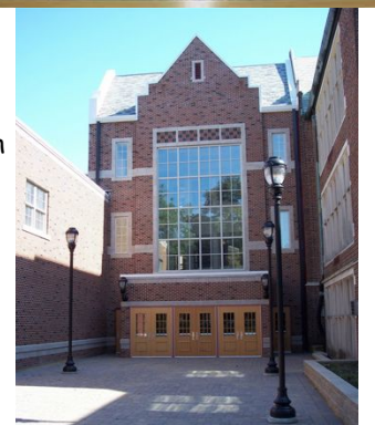
New high school entrance on Meadow Ave.

will use the entrance on Midland Avenue; middle schoolers (6th-8th graders) will access the school from the main Pondfield Road entrance; and high school students will use the new atrium entrance on the Meadow Avenue side of the school. The new high school atrium entrance was built over most of the "memorial courtyard space". A small courtyard space still exists, which can be accessed from the cafeteria as well as one of the hall-