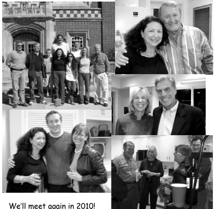
We'll meet again in 2010!

Be sure to check in on our website ( http://webpages.charter.net/drmorbius/bhs70.htm ) for pictures and news.