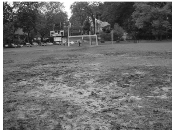
Chamber's field after some normal use...a little messy and muddy! This will all change with the new Turf surface!

If you are interested in donating to the Turf Field project, you can send a check made out to the "Broncos Fields Project—Bronxville School Foundation" to the Bronxville School Foundation, 177 Pondfield Road, Bronxville, NY 10708. Any donations would be appreciated.