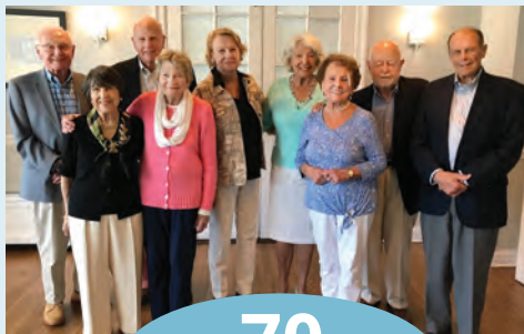
Class of 1948 Reunion

Donate online at www.bronxvilleschoolfoundation.org