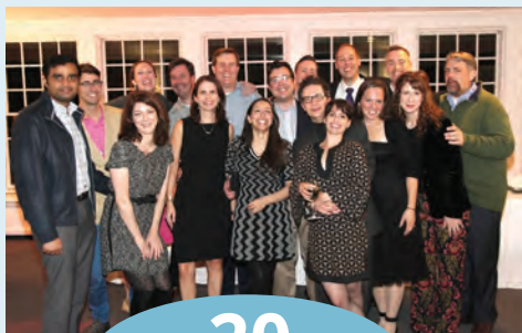
Class of 1998 Reunion