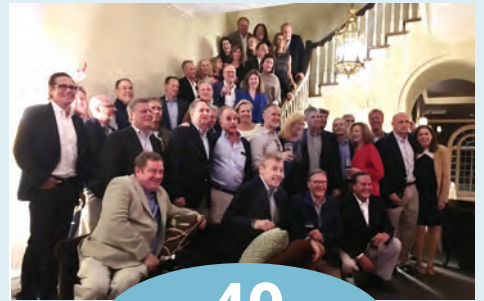
Class of 1978 Reunion