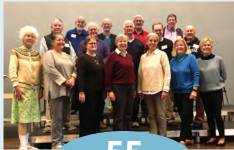
Class of 1963 Reunion