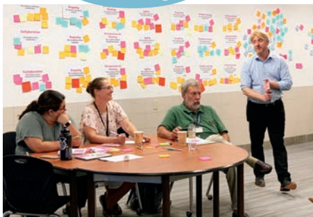
Design Thinking on High School Experience