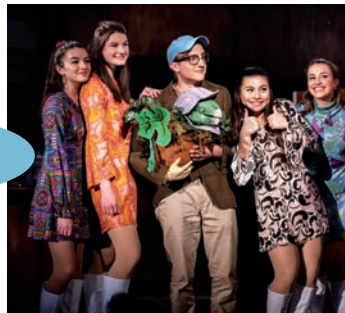
Puppet Building Workshop for High School Musical