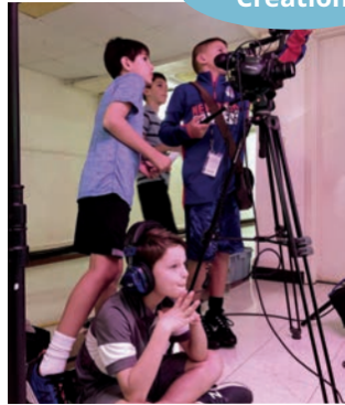
Fifth Grade Video Creation: Navigating Social Media