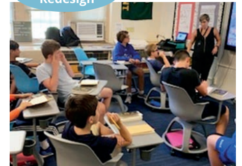
Innovative Designs in Education: Classroom Redesign Phase II