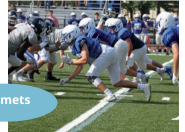
State-of-the-Art Football Helmets