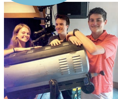
Audio and Lighting Upgrades for Auditorium