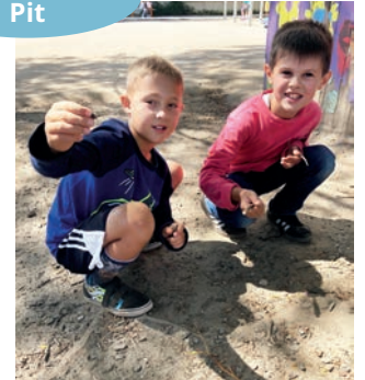
Elementary School Archaeology Pit