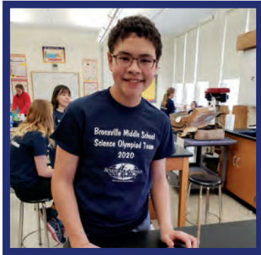
STEM Facilities & Equipment

These grants were awarded for implementation in the 2020-21 academic year. In some cases, the pandemic has created implementation delays or slight grant modifications. The Foundation is committed to providing the grant writers and the administration with the flexibility required to responsibly accomplish the goals of each grant.