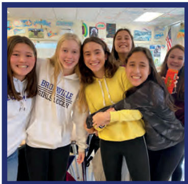
World Languages Initiatives