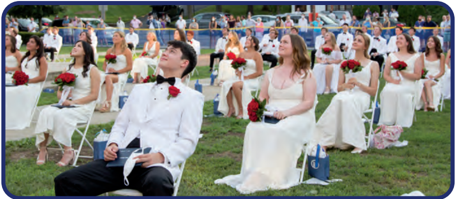
Socially Distanced Senior Class Graduation on July 18, 2020