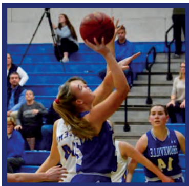
Athletic Equipment Upgrades