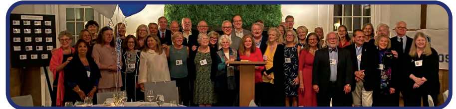
The Class of 1969 celebrated their 50th Reunion in 2019 and the Foundation appreciates their generous Class Gift.

The Foundation helps alumni stay connected to the Bronxville School. We appreciate their important support of our mission. Many thanks to the Alumni Classes who mark their reunions with donations.