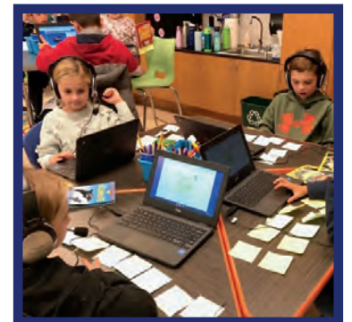
ES Technology Upgrades