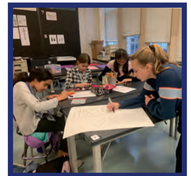
One Love MS Art Project