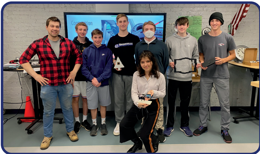
Project LUSY - "Let Us Seedfund You" Grant