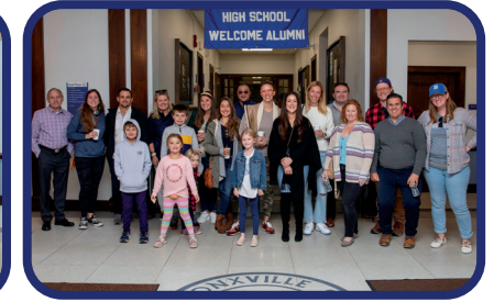
Class of 2002