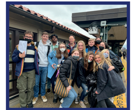
International Thespian Troupe