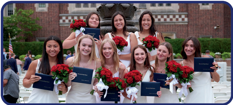
Senior Class Graduation on June 18, 2022