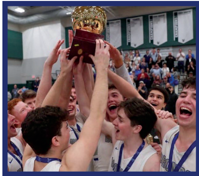
Athletic Equipment Upgrades