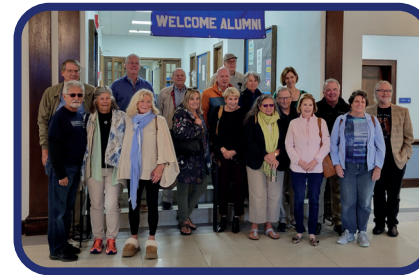
Class of 1970

We are so grateful alumni reunions were back this year! We appreciate the alumni's support of our mission. Many thanks to the classes that mark their reunions with donations.