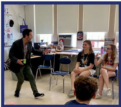
Delivering a Compelling Presentation