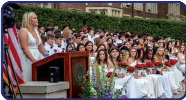
Senior Class Graduation on June 17, 2023