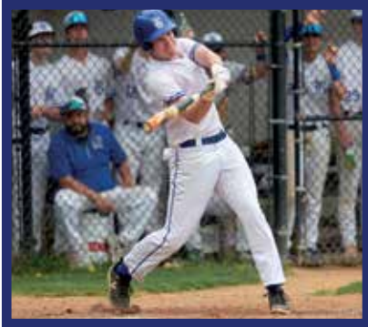
Athletic Equipment Upgrades

Athletic Training Room Upgrades Auditorium Projector & Projection Curtain Bronco Barn Bottle Filler Station Staff Lounge Furnishings Gaga Pit Life Skills/Speech Flexible Furniture Occupational Therapy/Physical Therapy Suite