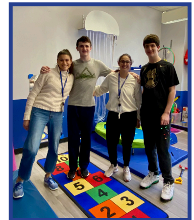
The OT/PT Suite