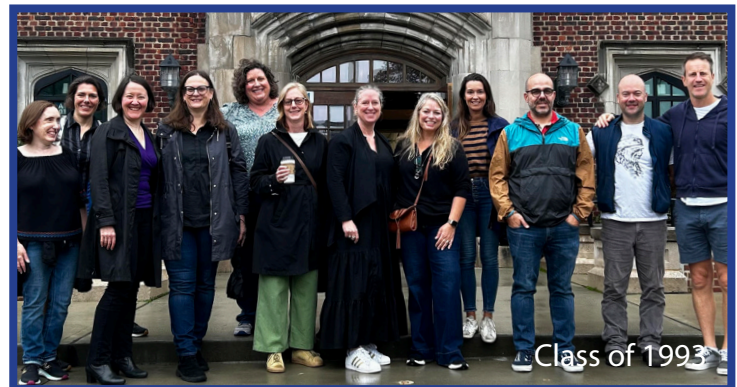
Class of 1993