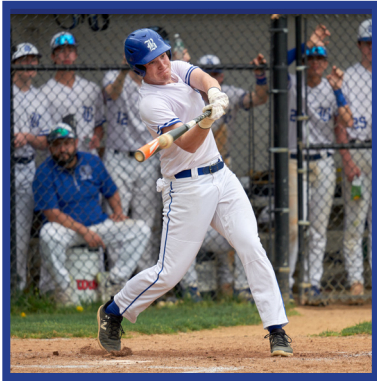
Baseball Batting Cages