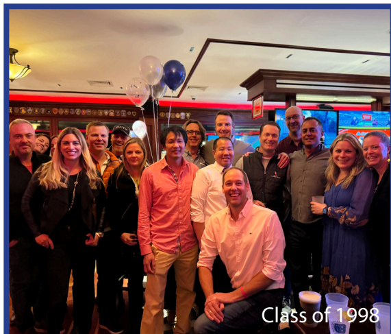
Class of 1998