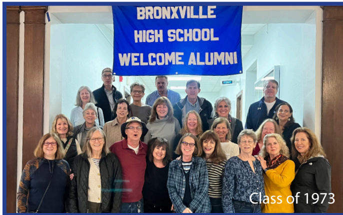
Class of 1973