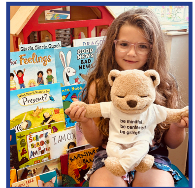
Health & Wellness