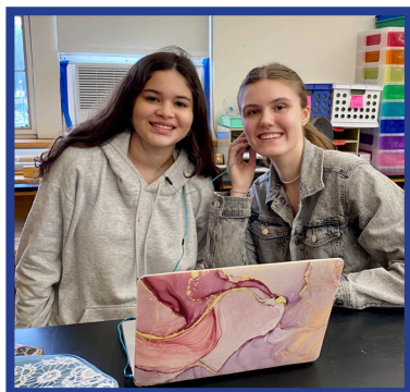
Artificial Intelligence Classes