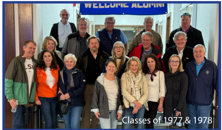
Classes of 1977 & 1978