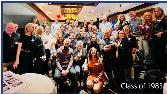
Class of 1983