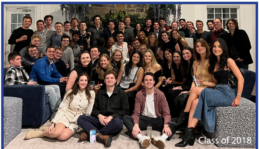
Class of 2018