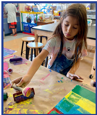
Printmaking in Visual Arts