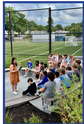
The New Outdoor Classroom