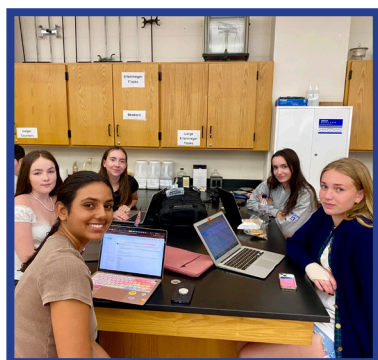
Artificial Intelligence Classes