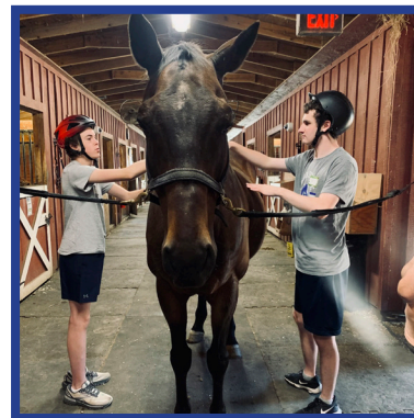
Equine Assisted Learning

AP Conference for World Languages AP Conference for Social Studies Finland Trip for Educators Critical Thinking Professional Development Gilder Lehrman Professional Development Nat'l Convention of Teachers of English Nat'l Council for Social Studies Conference