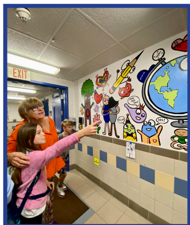
Bronxville Promise Mural