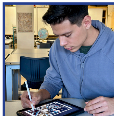
Visual Arts Technology Upgrades